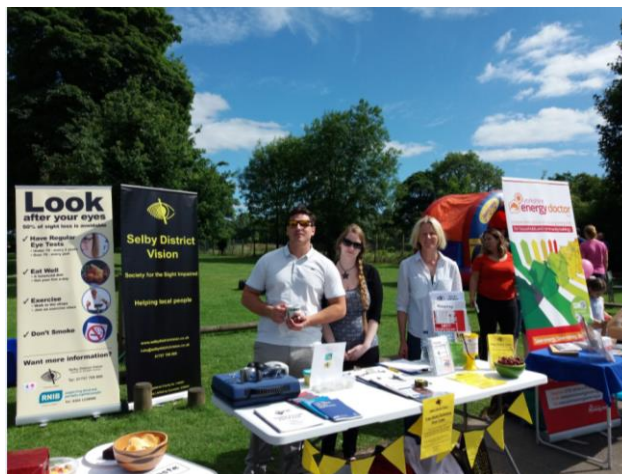
Chapel Haddlesey school fair