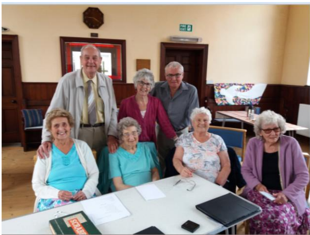
Carlton Wednesday group

We are still looking for potential groups and events in some of the villages and would particularly welcome any ideas/contact details for activities in Drax, Camblesforth, Kellington and Hensall.